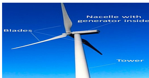
Fig. 5: Hybrid Composite Used in Wind energy applications