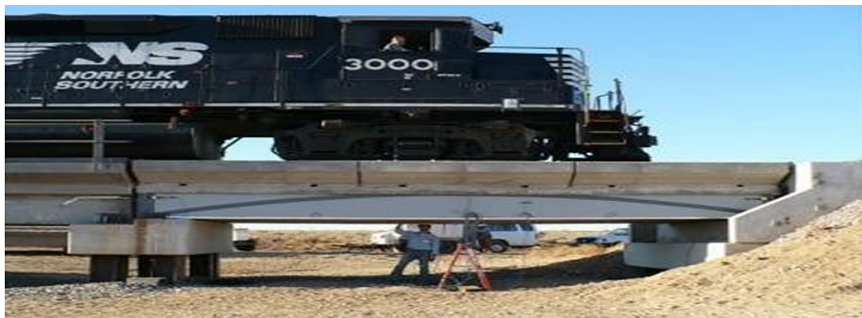
Fig. 1: Hybrid composite beam constructed rail road bridge. TTCl - Pueblo, CO 9.1m (30 ft)

fabricated composites by vacuum bagging process, 2 VARTM process, 4 and hand layup process 9 and tested their effectiveness. Studies were extended on composite material to determine and optimize the operational characteristics, 5,6,7 Cavitation response, 3 natural frequencies, 9 Finite element methods. 12 we could take advantage of composite materials and characteristics to achieve a specific goal, which could lead to better performance than using alloy materials. The ambiguity that which composite is more suitable and again if it is preferable hybrid composite leads in withholding the load, propeller types, operating speed and torque requirements. Among numerous varieties of propellers and composite material suggested by researchers globally were reviewed in this paper for emphasizing them for future applications.