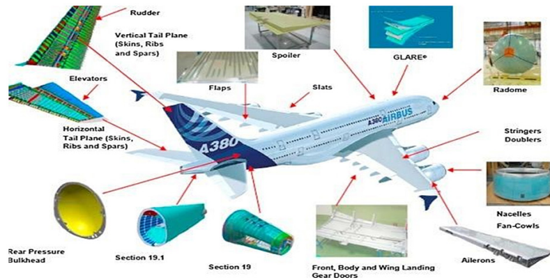
Fig. 4: Hybrid Composite Used in Aerospace application

is most widely used in aerospace application. Fiber reinforced epoxy composite have been recycled of aircraft engine to intensify the achievement of the system. Hybrid composite material can make pilot cabin door and transport system. The application of glass fiber-epoxy composite ranging from printed circuit boards to shotgun barrels.