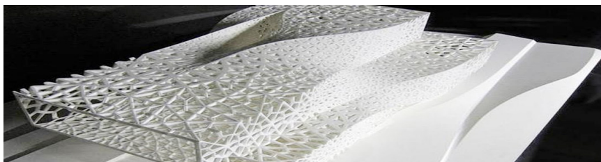
Fig. 2: Hybrid Composite Structure

lightweight and corrosion resistant. These beams are very effective, low cost than the orthodox structural members. Hybrid composite have more Safety and excellent strength than the standard and it gives a minimum maintenance of structure. Hybrid composite is much stronger than steel and concrete.