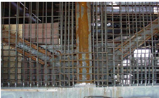
Fig. 2: illustrates the transition zone from the lower floor to the upper floor. 32

Further, this study led to the development of performance and installation of the system and requirement of interstate highway system leading to bridge and then to the building structures designs through the number of platforms such as seminars, books and series of articles. 31 The utilization of composite columns in vertical systems is limited to high rise buildings or the use of concrete on the lower floor and steel design implementation on the upper floor.